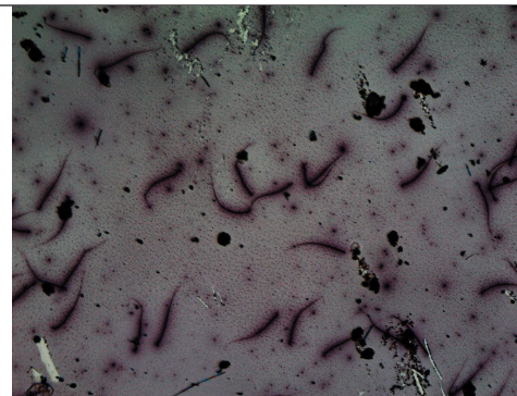
Fig. 2. sperm cells with bent and curved tails (star) observed in group dosed with 400mgkg -1 of A. muricata .