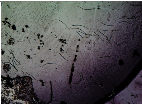
Fig. 1. sperm cells with bent tails (star) observed in group dosed with 200mgkg -1 of A. muricata .

Histopathology of the testis of rats administered different doses of extract of AMMBE revealed varying degrees of testicular degeneration and atrophy characterized by moderate variation in sizes of seminiferous tubules (Fig 4, 5 & 6).