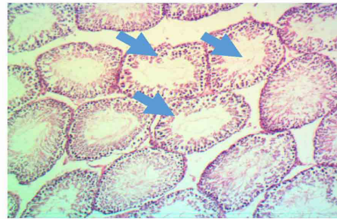
Fig. 6. Testis section showing moderate testicular degeneration and atrophy. Focal hypocellular seminiferous tubules (arrowed) with wavy basement membrane and clear wide luminal diameter. Focal widening of the interstitial spaces. H & E. X10 (Effects of 800 mg/kg-1 of Annona muricata ).