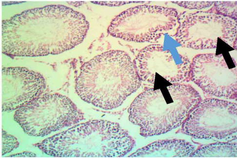
Fig. 5. Testis section showing moderate testicular degeneration and atrophy characterized by moderate variation in sizes of seminiferous tubules, wavy basement membrane (blue arrow), hypocellular seminiferous tubules (arrowed) and distended interstitial spaces. H & E. X10 (Effects of 800 mg/kg-1 of Annona muricata )