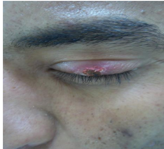
Figure 3. Cutaneous leishmaniasis of the left upper lid without involvement of the anterior segment of the eye.

Figure 2. Erythematous and nodular lesion of the upper lid with central crust