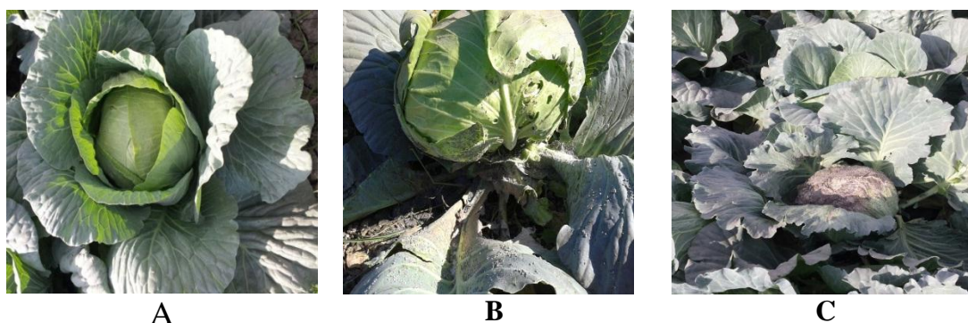
Figure1. Cabbage aphid Brevicoryne brassicae damage symptoms on cabbage plants (A: Healthy plant, B: Infested plant, C: Unmarketable plant)